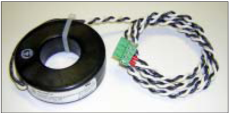
Primary Coil (P5)