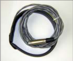
Rogowski Coil (S6)