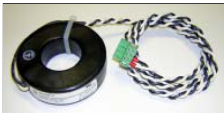
Primary Coil (P5)