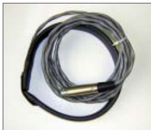
Rogowski Coil (S6)